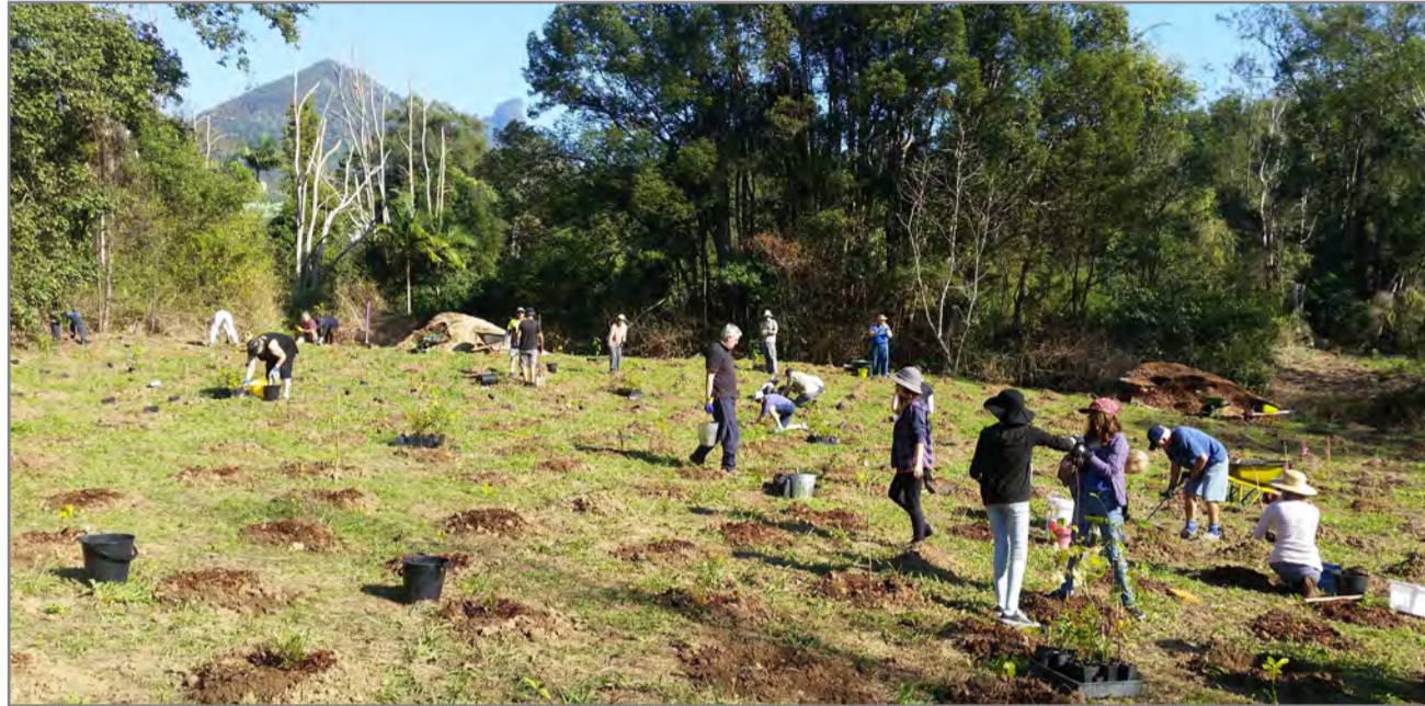
Tree planting at Cudgenbil Hole near Uki as part of National Tree Day in 2016.