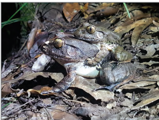
A pair of Mixophyes iteratus detected during a survey at Mebbin National Park on 20 March 2020. Note the size difference between the male and female.

This is a National Gallery of Australia touring exhibition. For more information, visit nga.gov.au/nolan