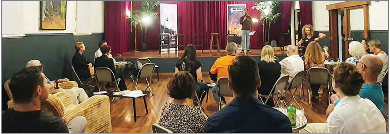
Come along to the Succeed in Tweed event workshop at The Citadel in Queen Street, Murwillumbah.

www.nsw.gov.au/covid-19/dine-discover-nsw