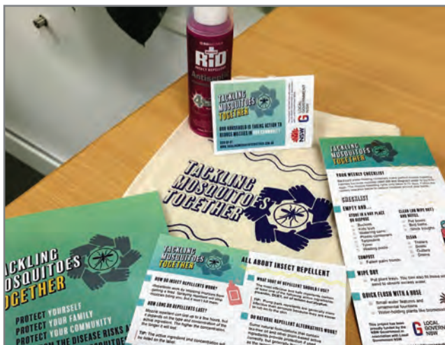
Check out the great pack you get when you register for the Tackling Mosquitoes Together SMS text message program.

Join hundreds of your fellow Tweed residents to Tackle Mosquitoes Together. Register now at www.tacklingmosquitoestogether.com.au