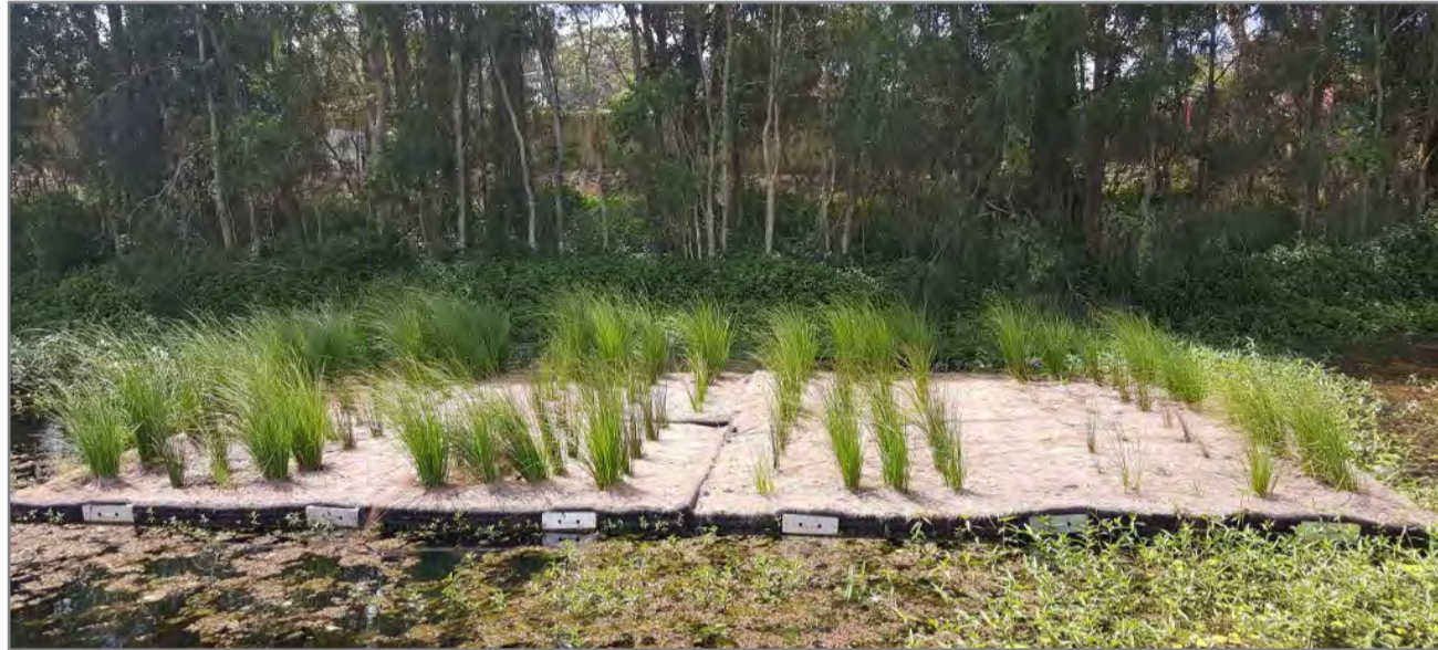
Reed beds at Banora Point help reduce environmental impact.

Tweed Shire Council wishes to recognise the generations of the local Aboriginal people of the Bundjalung Nation who have lived in and derived their physical and spiritual needs from the forests, rivers, lakes and streams of this beautiful valley over many thousands of years as the traditional owners and custodians of these lands.