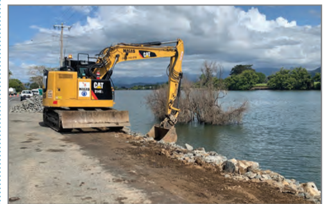
Repairs were carried out to fix a land slip into the Tweed River.

If you would like to discuss further or need any more information contact Council on 02 6670 2400.