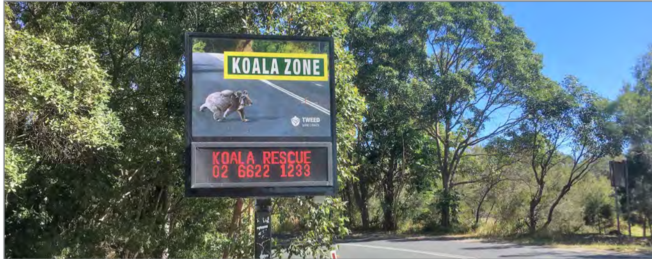
The fixed koala zone sign on Clothiers Creek Road features the emergency contact number for Friends of the Koala should anyone come across an injured koala.