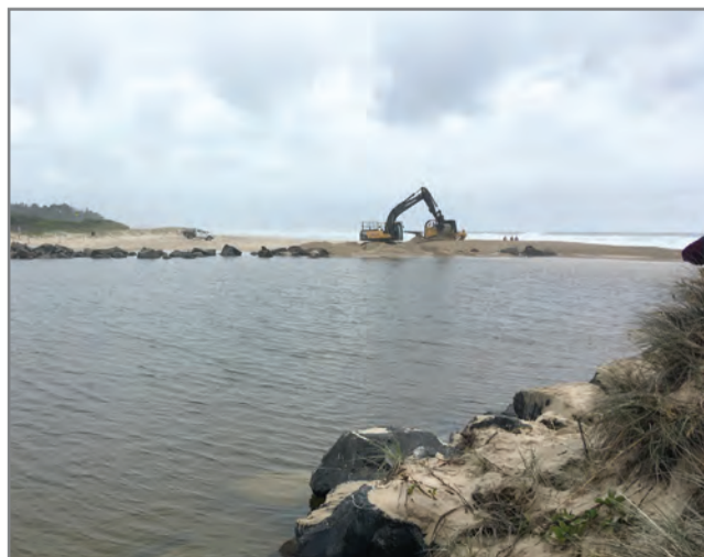
Council workers unblock the mouth of Mooball Creek in 2018.