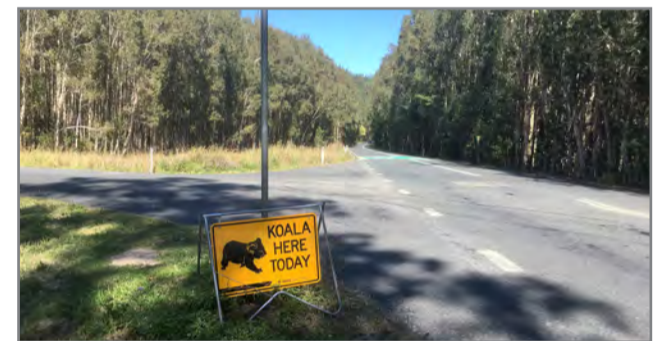
Warning signs have been placed on Clothiers Creek Road on the Tweed Coast advising motorists to be aware of koalas crossing.

Visit www.nbnco.com.au/corporate-information/media-centre/events for more information.