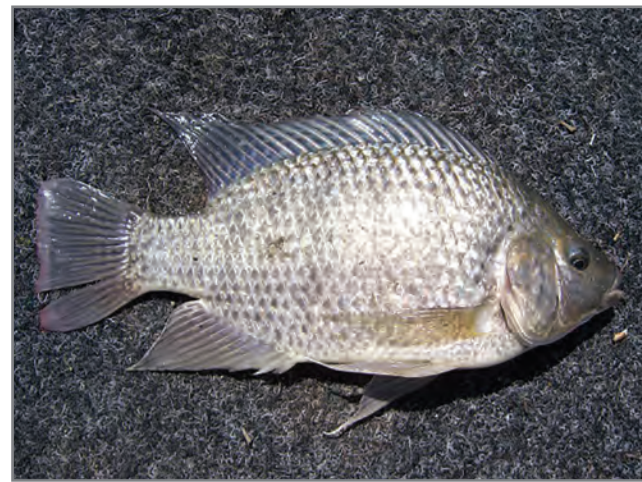
Anglers are being encouraged to record their catches of tilapia in Tweed Waterways as part of a public awareness campaign to monitor the spread of the pest fish. Pictured, Mozambique tilapia.

To get involved in stopping the spread of tilapia, contact Council by calling 02 6670 2400.