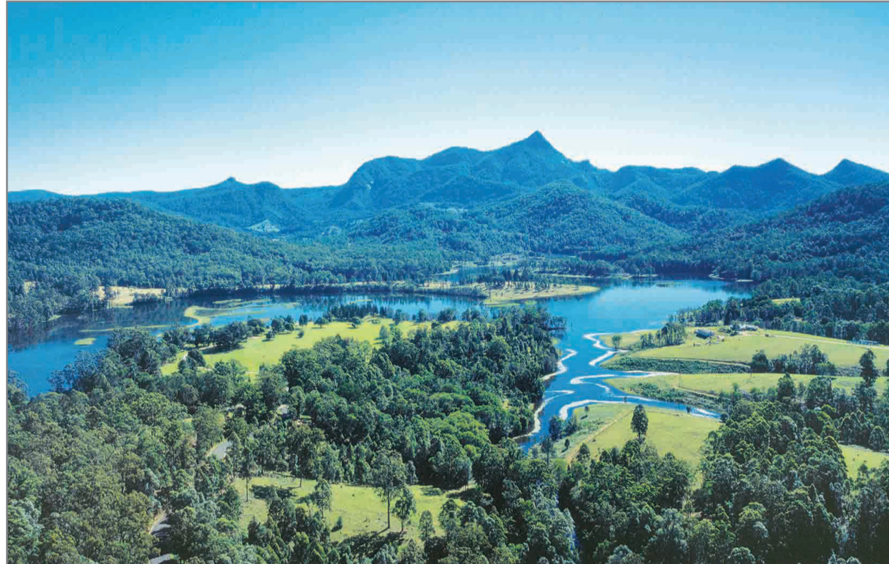
Raising the wall at Clarrie Hall Dam will double the dam's footprint, treble its capacity and provide security of water supply for the Tweed to 2046 or beyond.