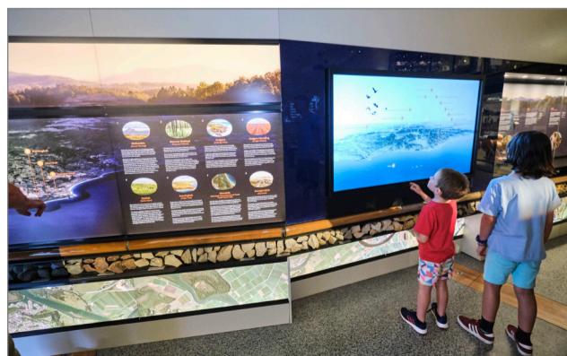
Exploring the free Land | Life | Culture exhibition at Tweed Regional Museum in Murwillumbah.