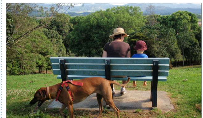
Benches made from recycled plastic are just one of the ways Tweed Shire Council is encouraging less to landfill.

You can subscribe to receive the Tweed Link for free directly to your inbox at www.tweed.nsw.gov.au/subscribe