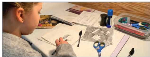
Zara, 8, from Elanora completing the latest ART PLAY activity.