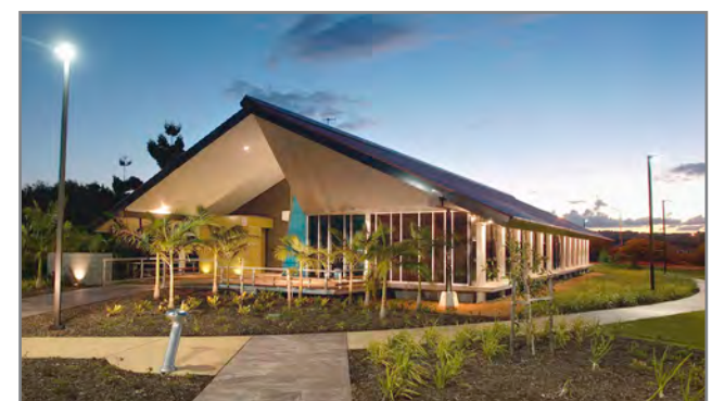
Banora Point Community Centre is just one of those reopening on 1 July.

For more information on the status of Council services during COVID-19 restrictions visit emergency.tweed.nsw.gov.au/coronavirus