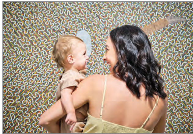
Plan a visit to the Gallery and book your tickets online.

Book your free ticket to the Gallery trgmoac.eventbrite.com.au