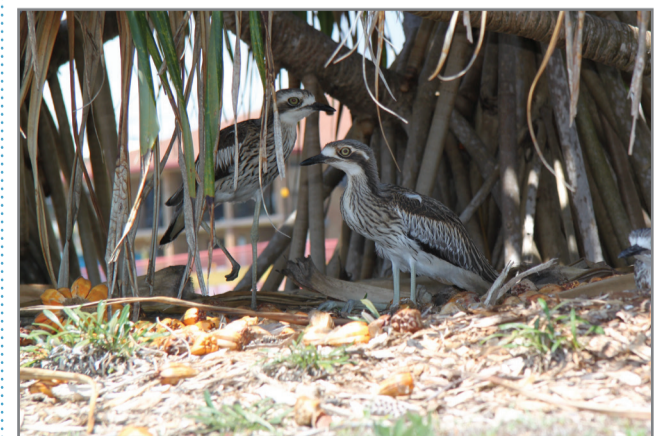
Report sightings of Bush Stone-curlews to increase local knowledge of this endangered bird.

www.tweed.nsw.gov.au/bushstonecurlewsighting