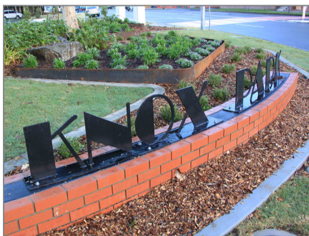
The upgrade includes art deco-style entry signage.

For more information visit www.tweed.nsw.gov.au/knoxparkupgrade and check out Council's Facebook page for more photos of the makeover.