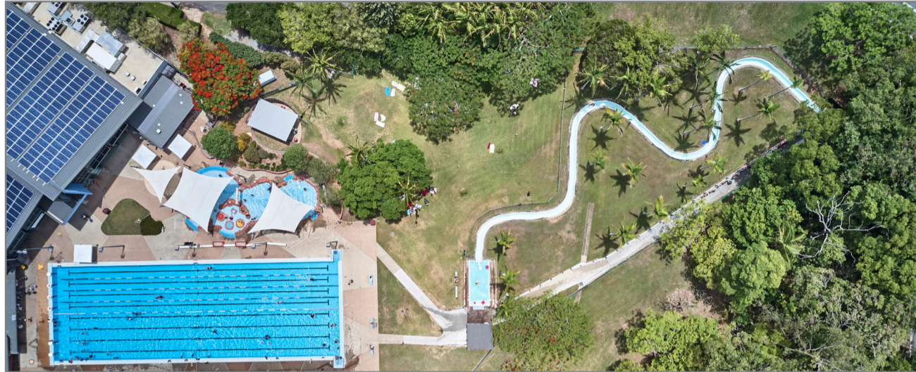
Tweed Regional Aquatic Centres (TRAC) is reopening the Murwillumbah facility for squads only. Members of the public can book a lane for lap swimming at TRAC Kingscliff.