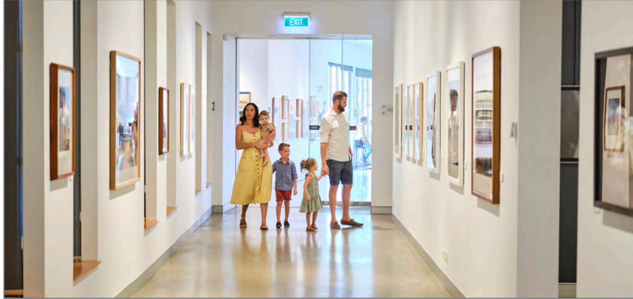
Council will put safety first in deciding when community facilities open, such as the Tweed Regional Gallery and Margaret Olley Art Centre. (Photo is pre-pandemic.)

Tweed Shire Council wishes to recognise the generations of the local Aboriginal people of the Bundjalung Nation who have lived in and derived their physical and spiritual needs from the forests, rivers, lakes and streams of this beautiful valley over many thousands of years as the traditional owners and custodians of these lands.