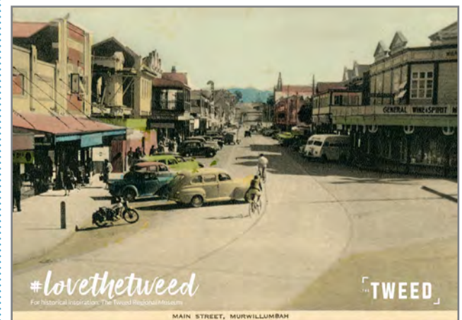
Historic Murwillumbah features in the latest digital jigsaw puzzle available for free online.

Check out #LoveTheTweed at visitthetweed.com.au/lovethetweed