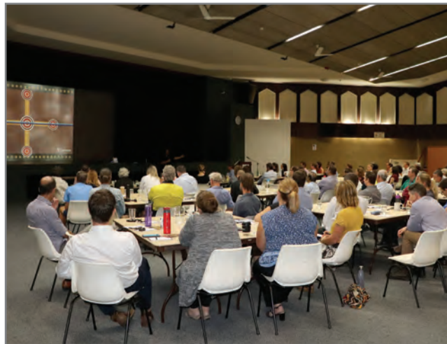
Council staff attend a Banaam Cultural Intelligence Workshop to increase understanding of Indigenous culture.

Building on over 20 years of relationships through the Aboriginal Advisory Committee, Tweed Shire Council's first Reconciliation Action Plan 2018-2020 (RAP) was launched in 2018 and outlines Council's commitment to reconciliation.