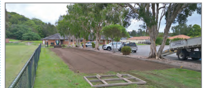
Council has successfully used recycled concrete as a base to support the building of aluminium grandstands at Piggabeen Football Ground.

Clean up Australia Day Sunday 1 March 2020