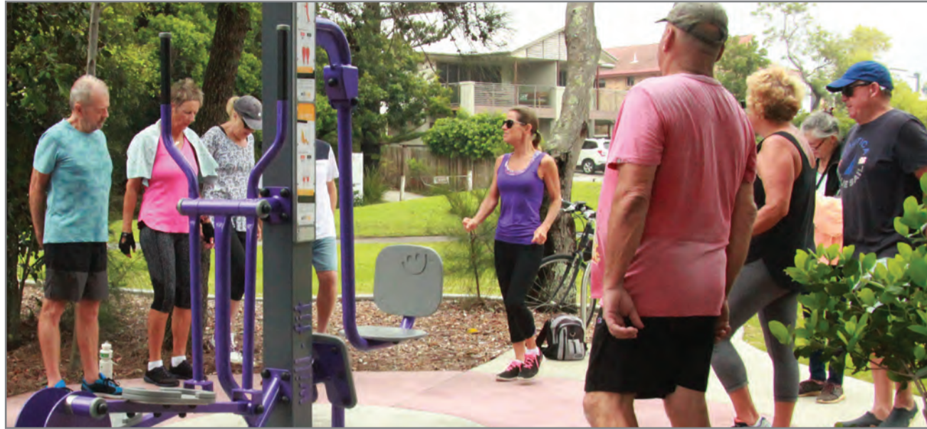
Local residents warm up for the free training session, after the opening of the exercise equipment at Phillip Street Reserve, Pottsville.

Tweed Shire Council wishes to recognise the generations of the local Aboriginal people of the Bundjalung Nation who have lived in and derived their physical and spiritual needs from the forests, rivers, lakes and streams of this beautiful valley over many thousands of years as the traditional owners and custodians of these lands.