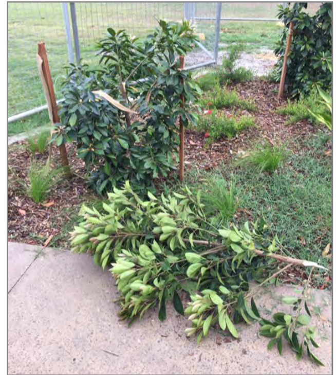
Newly planted trees snapped in half at the Knox Park upgrade.

For more information on the Knox Park upgrade, visit www.tweed.nsw.gov.au/KnoxParkUpgrade