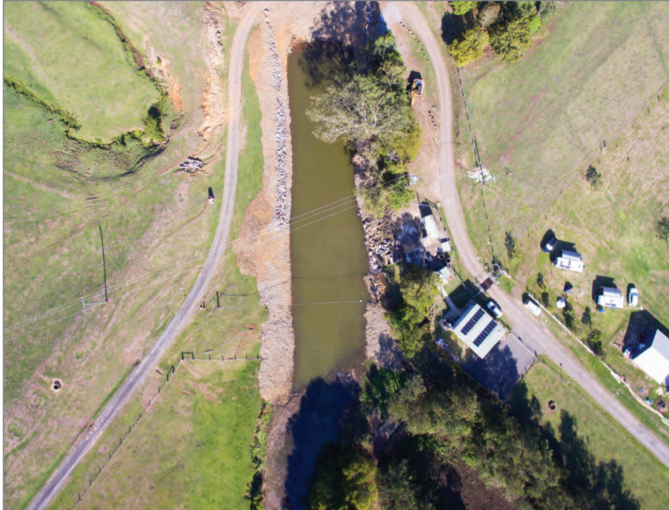
An aerial view of the upgraded Tyalgum weir pool.