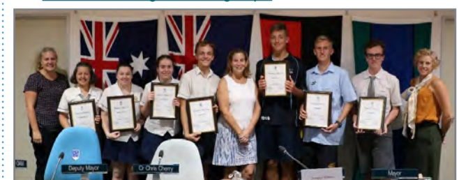
The final Youth Council meeting for 2019 with Council staff and some of the Youth Council members.

To find out more about Youth Council and young people in the Tweed visit www.tweed.nsw.gov.au/YoungPeople