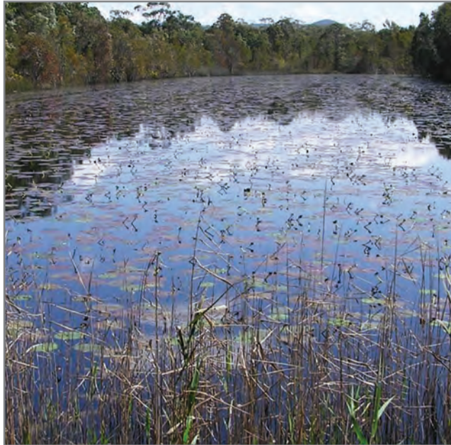
September 2011: Normally, the freshwater canals behind Pottsville Waters are full as water continually flows in from the Pottsville Wetland. This area provides important koala habitat.

Tweed Shire Council wishes to recognise the generations of the local Aboriginal people of the Bundjalung Nation who have lived in and derived their physical and spiritual needs from the forests, rivers, lakes and streams of this beautiful valley over many thousands of years as the traditional owners and custodians of these lands.