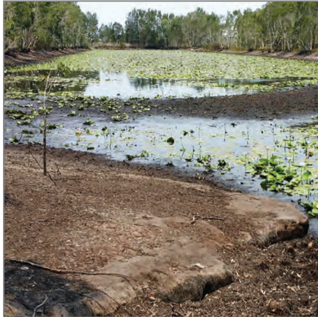
December 2019: The freshwater canals behind Pottsville Waters are drying as water has stopped flowing in from the Pottsville Wetland. The wetland is now dry.