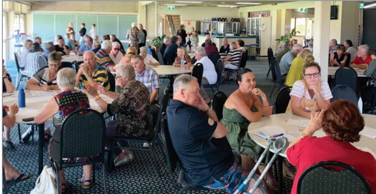
Plenty of interested locals participated in the Community Conversation on the future vision for Chinderah.

Tweed Shire Council wishes to recognise the generations of the local Aboriginal people of the Bundjalung Nation who have lived in and derived their physical and spiritual needs from the forests, rivers, lakes and streams of this beautiful valley over many thousands of years as the traditional owners and custodians of these lands.