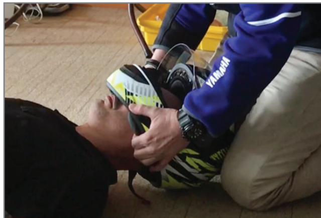
The course will teach how to remove the helmet of a crashed rider.

Council is sponsoring a free first aid and low-risk riding course for motorcyclists to raise awareness around this group of road users during National Motorcycle Awareness Month.