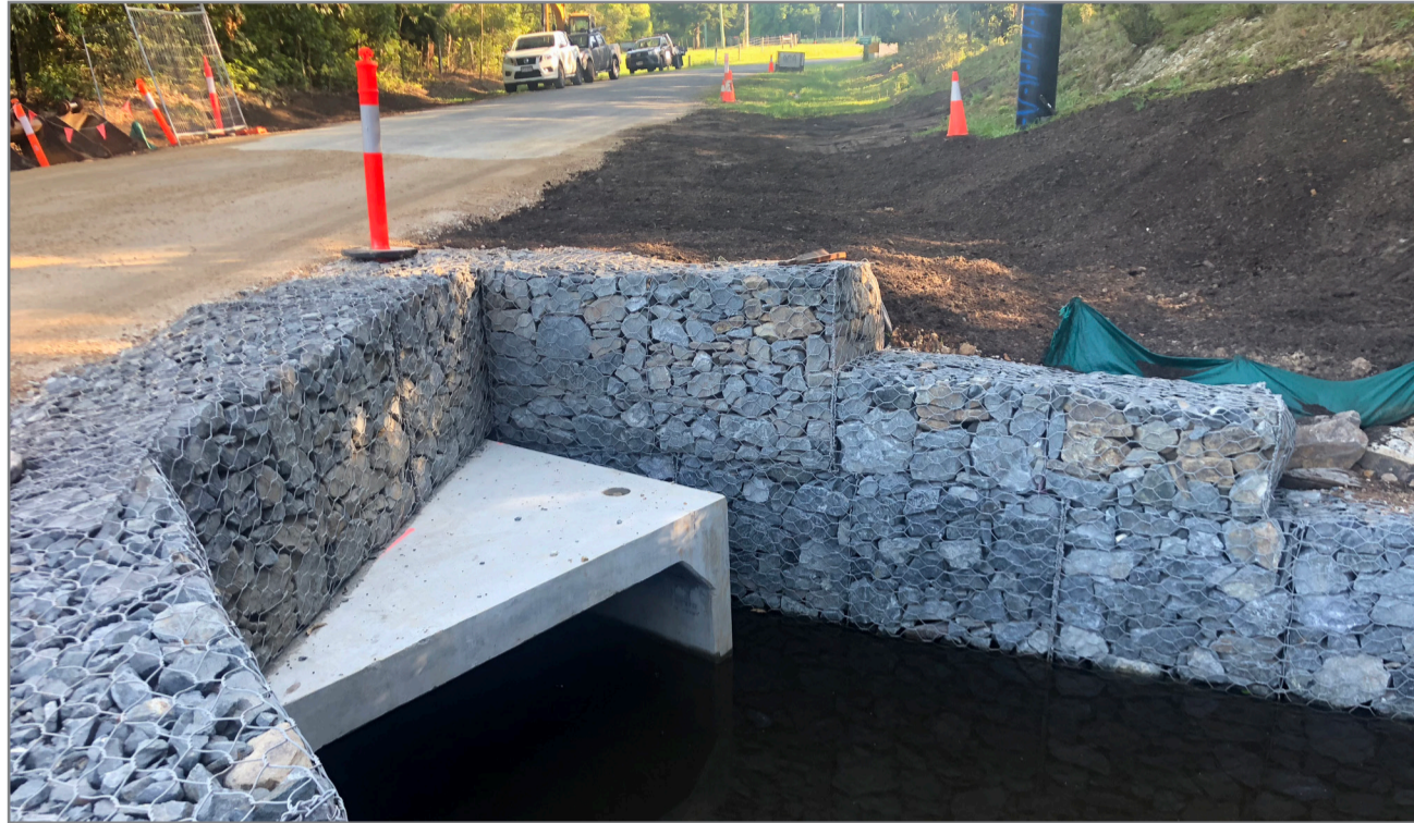
This work at Heron Road, Burringbar is an example of the types of major repairs required on Tweed's roads following the 2017 flood event.