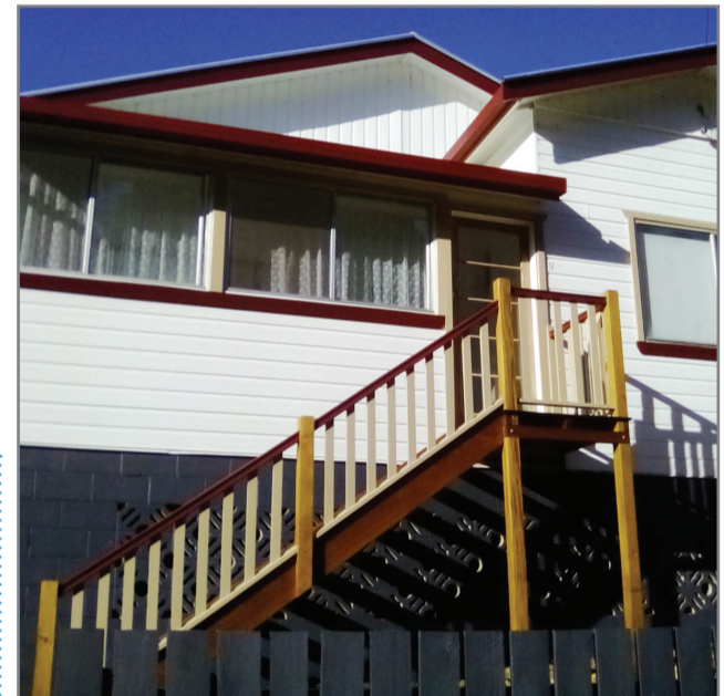
Before (above left) and after images of heritage works carried out through a previous Local Heritage Assistance Fund grant.

Grant guidelines, application forms and further information are available from Council's website www.tweed.nsw.gov.au/heritage , at the Murwillumbah Civic Centre or by calling Council's Strategic Planning Unit on (02) 6670 2503.