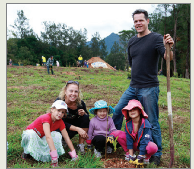
Volunteers at a previous National Tree Day event in Uki.

For more information on this annual community event see www.treeday.planetark.org/site/10021737