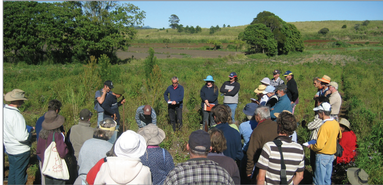
Council is finalising plans for a series of workshops and field days to help improve our local farmers land management skills.