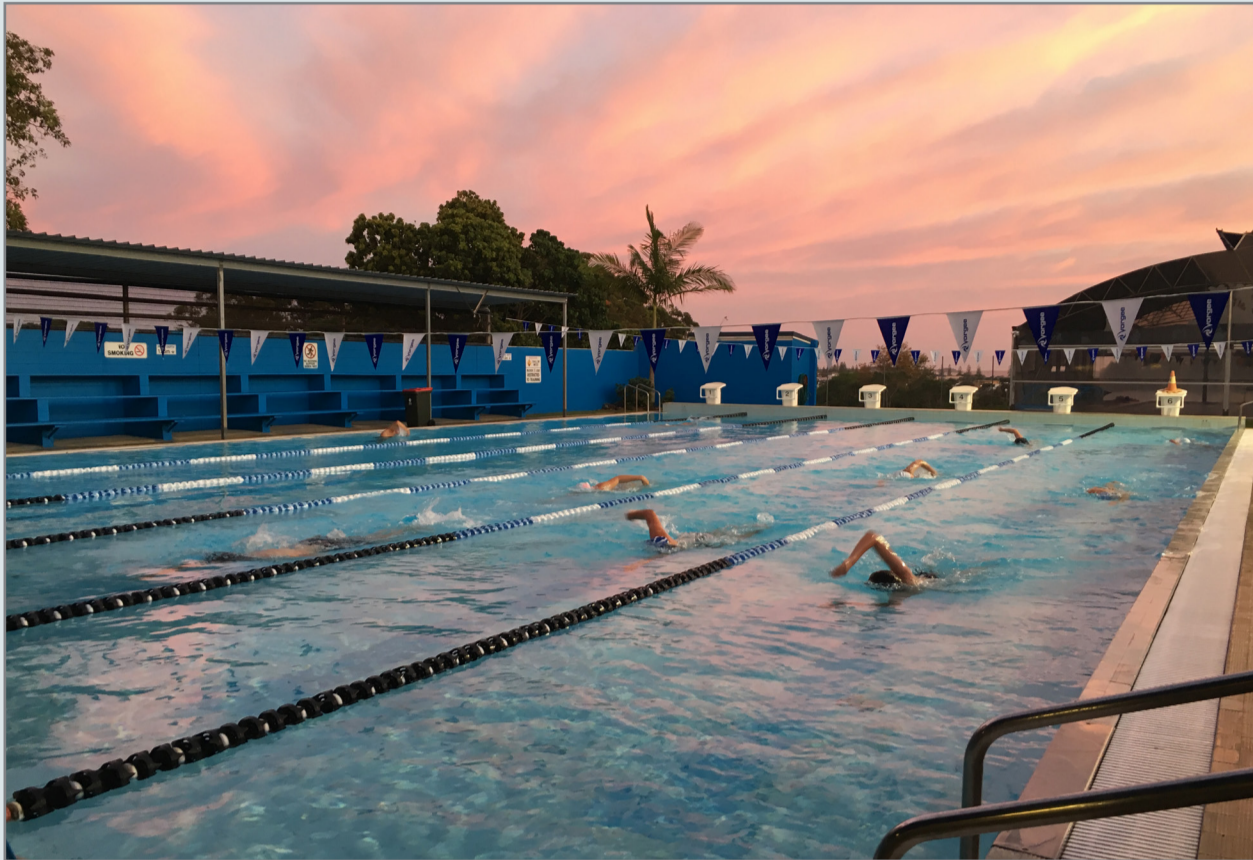
What a great time of year to head down to Tweed Regional Aquatic Centre Kingscliff to exercise in the 25-metre heated pool. It's heated to a pleasant 28 to 29 degrees. During the winter months, the Kingscliff facility is open 5.30am to 6pm Monday to Friday, 6am to 12pm on Saturdays and 9am to 12pm on Sundays. For more information visit https://trac.tweed.nsw.gov.au/ or call (02) 66740195.