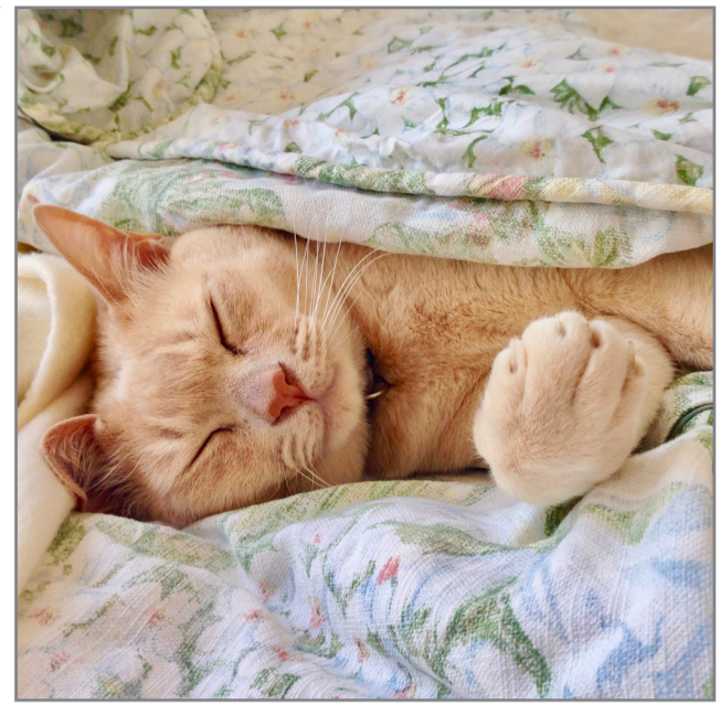
Bad Boy Leroy loves the indoor life.