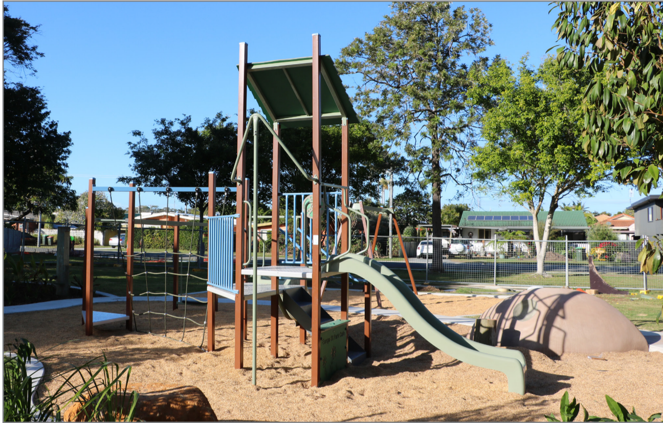
Eunga Street Park in Tweed Heads South is now welcoming and accessible, thanks to a recent makeover.