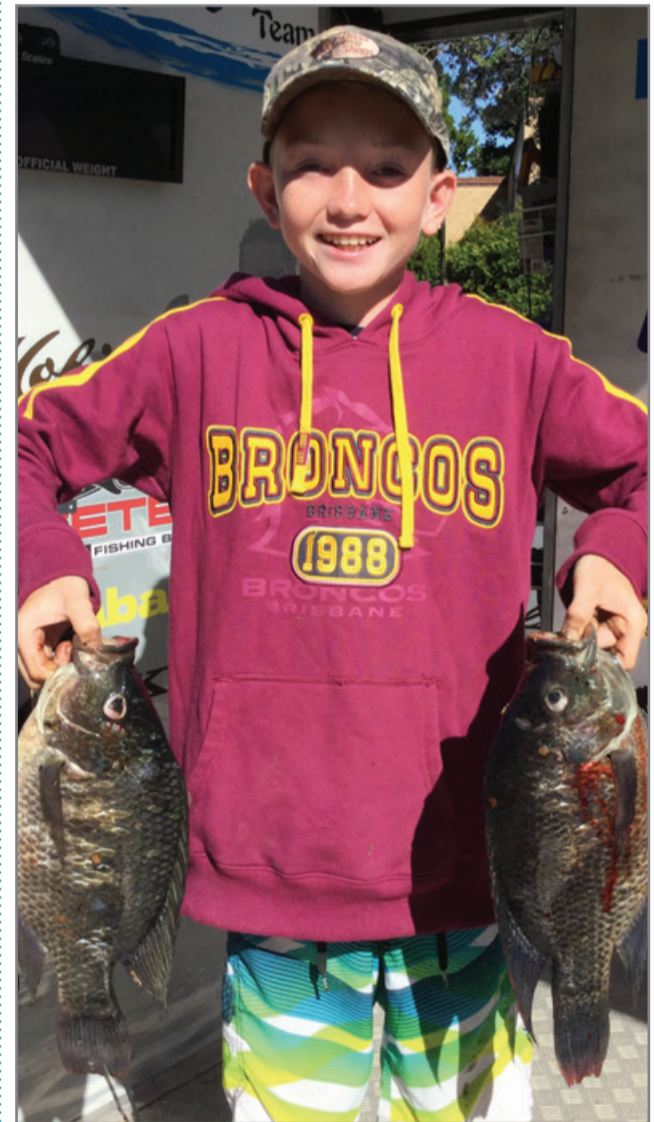
A great effort by a young competitor at last year's Cudgen Tilapia Buster.