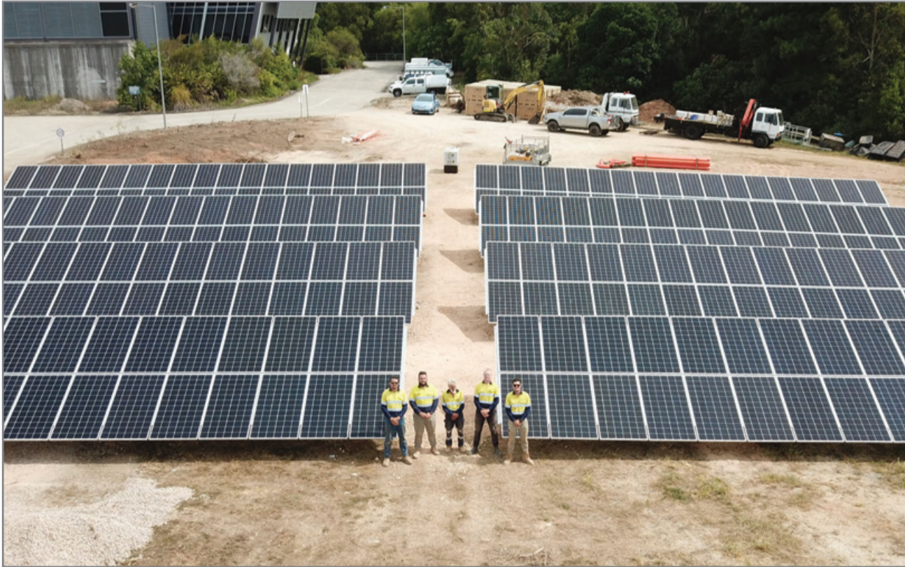
Council also recently installed solar panels at its Bray Park Water Treatment Plant.