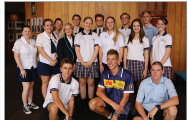
Tweed Shire's Youth Council is supported by the Community Development Team.

For those unable to attend a focus group session, visit www.yoursaytweed.com.au/communitydevelopment to read more and have your say or call Council on (02) 6670 2400. Hard copies of the survey can be collected from either Council's Murwillumbah or Tweed Heads administration offices.