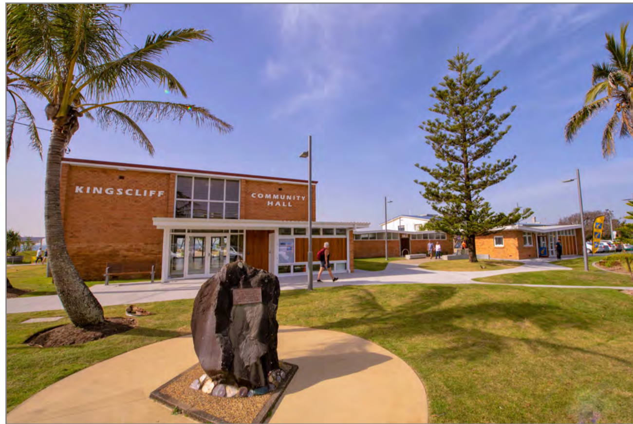
Last week Council was named as joint winner in the Conservation Built Heritage category at the National Trust Awards for the restoration of Kingscliff Community Hall. The refurbishment of the hall was part of the recent $22 million project to revitalise Kingscliff Foreshore. The awards acknowledge and celebrate the greatest innovation, conservation, education and advocacy with a view to preserving or protecting

Comments can be made in writing by email to tsc@tweed.nsw.gov.au or dropped off at either the Tweed or Murwillumbah Civic Centre Offices by 24 May 2019. Independent auditors review our fees and charges