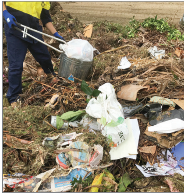
Incorrect waste put into the green organics bin has to be removed by hand at an extra cost to Tweed ratepayers.

The less sorting that needs to be done after collection and the less that goes to landfill, the better off our environment and bank accounts will be. For information about what goes in your bins visit www.tweed.nsw.gov.au/Waste or email waste@tweed.nsw.gov.au