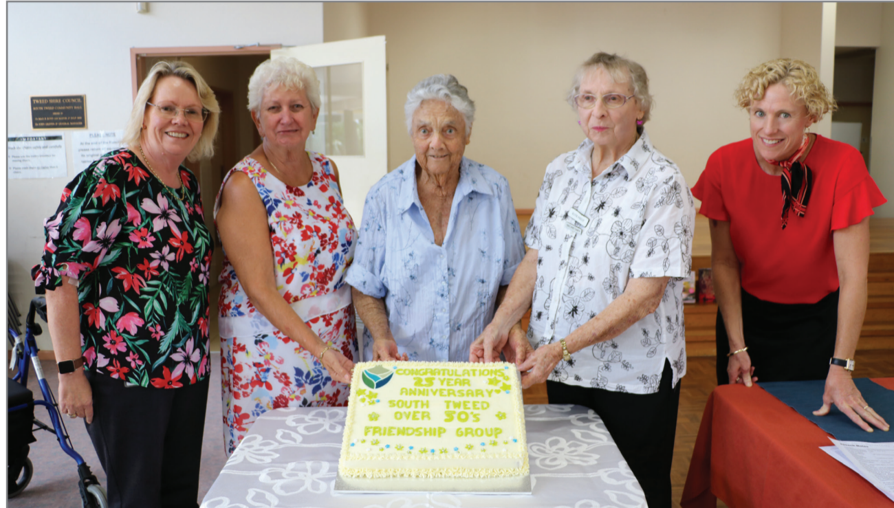
Happy anniversary to the Over 50s Friendship Group, who have been meeting at the Tweed Heads South Community Hall for a quarter of a century.

Minutes of these meetings will be available as soon as practical following the meetings and are unconfirmed until they are formally adopted at the next Council meeting.