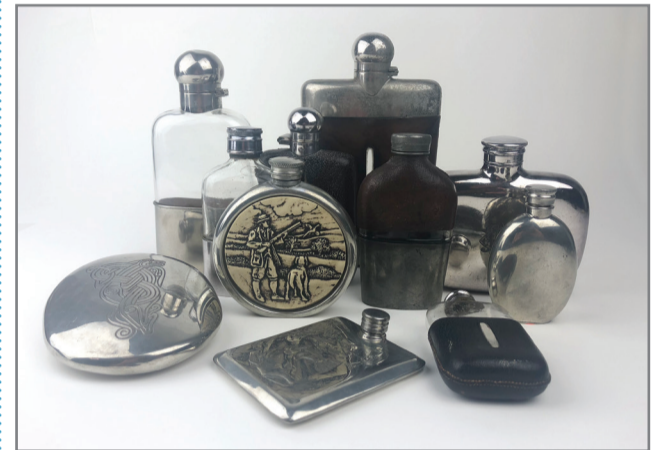
Hip flasks in all shapes and sizes from across the world are on show at Tweed Regional Museum, Queensland Road, Murwillumbah.