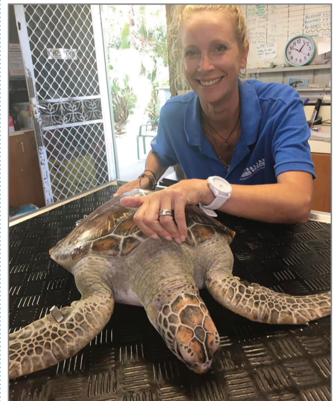
Here is some great news about Lion, the Green Sea Turtle we told you about in a past issue, who was rescued by Salt Surf Life Saving Club members a few months ago. After successful rehabilitation, she was recently released by Australian Seabird Rescue at Ballina's Lighthouse Beach, along with four other turtles. Lion was suffering from floating syndrome – which is where a turtle is buoyant and unable to dive and feed. It's caused by a build-up of gas in the turtle's body after it has ingested marine debris, including plastics. She was also being affected by large burrowing barnacles. Stay safe out there, Lion!