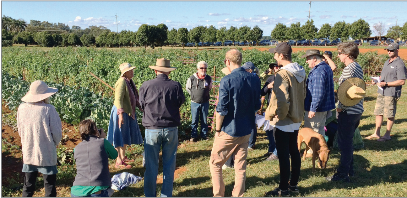
All farmers and land managers in the Tweed are requested to complete a short survey to help develop a new skills program.