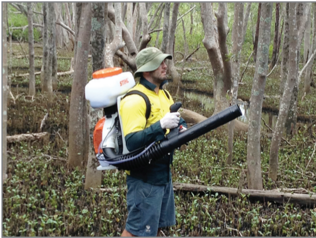
Mosquito control – ground treatment being undertaken by Council staff.

Recent rain and higher than usual tides across the Tweed have created ideal conditions for mosquito breeding.