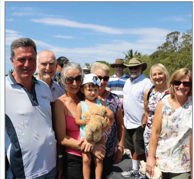
Some of the happy residents who turned out to celebrate the official opening of the Anchorage boardwalk.

Over the next few weeks, watch out for Council's 'Dogs of the Tweed' campaign – on social media, posters and in the Tweed Link – which will encourage residents to share stories about their dogs and spread the message about responsible pet ownership and the importance of wildlife protection.