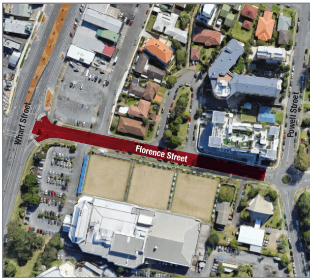
The worksite on Florence Street. This work will be carried out at night.

Weather permitting, the works will be carried out from Monday 25 March to the evening of Thursday 11 April.