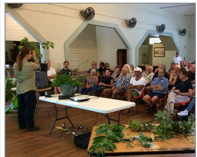
Plenty of local landowners and residents attended the workshop at Uki Hall to examine the 'Worst Weeds of the Tweed'.

Tweed Landcare plans to continue the focus on weeds with a weed strategy and treatment workshop planned for later in the year.