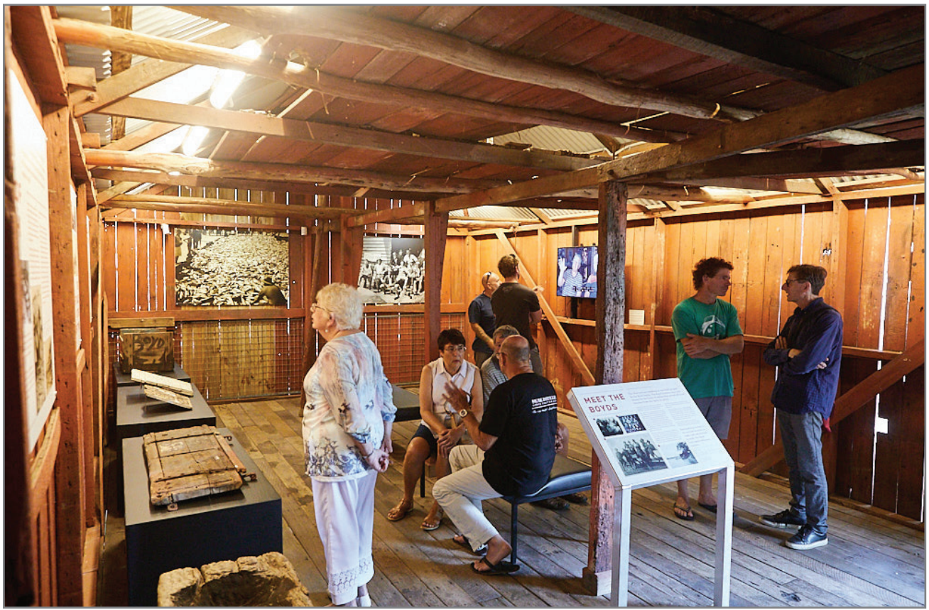
Museum staff have spent six months refurbishing the shed and interpreting its rich history which is now once again on display for a new generation of visitors to enjoy.