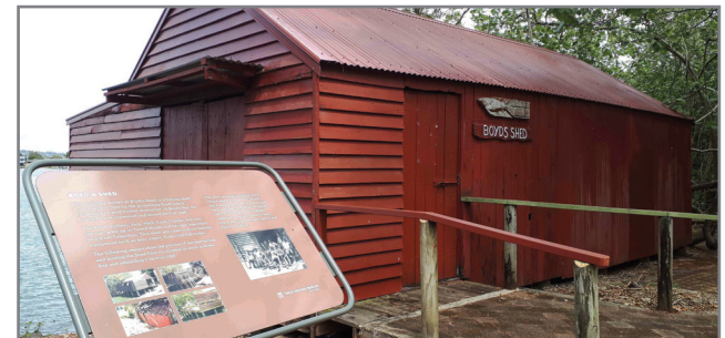
Explore the heritage-listed Boyds' Shed at the Tweed Heads branch of the Tweed Regional Museum, the base for the family's commercial fishing operations from the 1920s to the 1960s.

The Tweed Heads branch of the Museum is open every Tuesday, Wednesday, and Sunday from 10am to 4pm (NSW time). For more information visit museum.tweed.nsw.gov.au