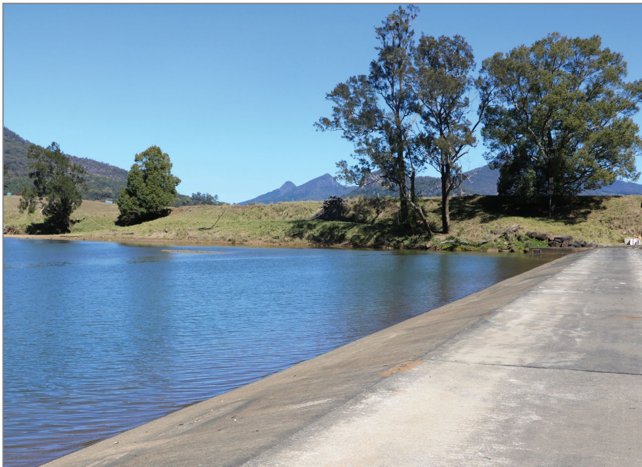
A blue-green algal bloom at the Bray Park Weir is largely because the river flow has been severely reduced due to the lack of rain.