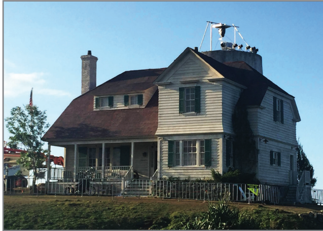
Recognise this house from the blockbuster Aquaman ? The set was constructed on the headland at Hastings Point.

Find out why Murwillumbah is the perfect place to spend a day out with all the family at www.tweed.nsw.gov.au/Holidays