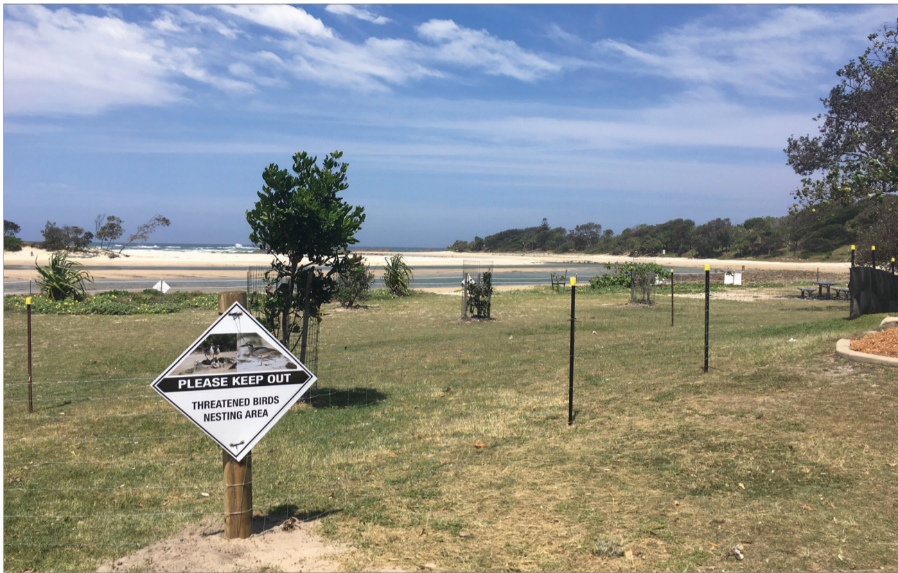
Be careful to avoid the curlews nesting at Cudgera Creek Park, Hastings Point.