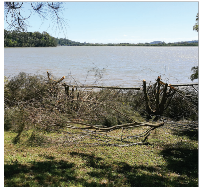
These trees were wilfully damaged in the latest vandalism incident at Broadwater Esplanade, Bilambil Heights.

The Annual General Meeting of the Friends of Tweed Heads Library will take place on Wednesday 12 December 2018 at 10.30am in the Bruce Graham Room at the Tweed Heads Library.