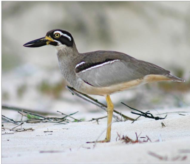
A critically endangered Beach Stone-curlew.

A critically endangered pair of Beach Stone-curlews have decided to nest at Cudgera Creek Park, Hastings Point – laying a single egg straight on the ground.