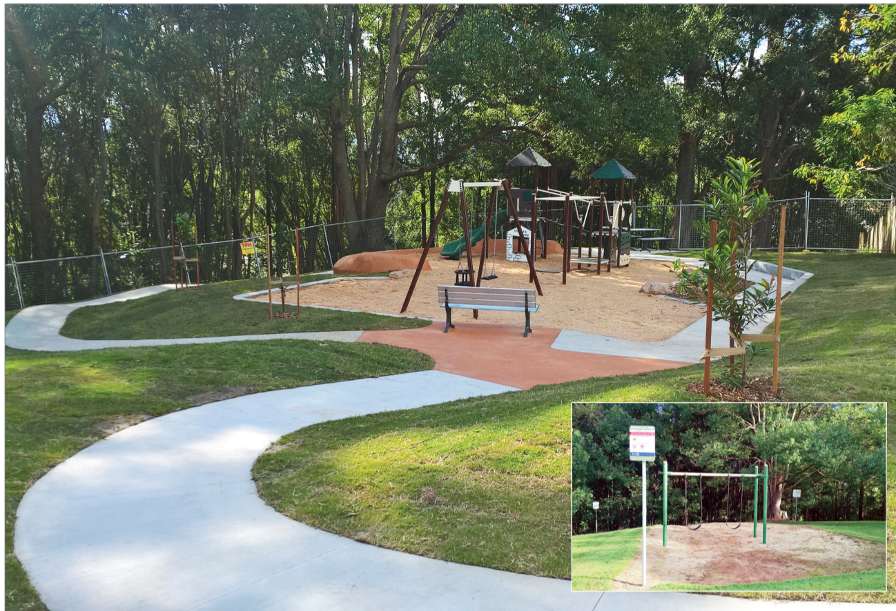
Before (inset) and after photos of Arbor Place Park, Murwillumbah, following valuable input from the local community.