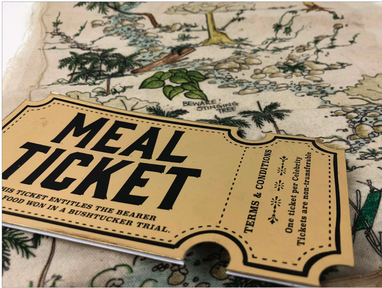
Some of the props featuring in the I'm a Celebrity...Get Me Out of Here! display at the Tweed Regional Museum.