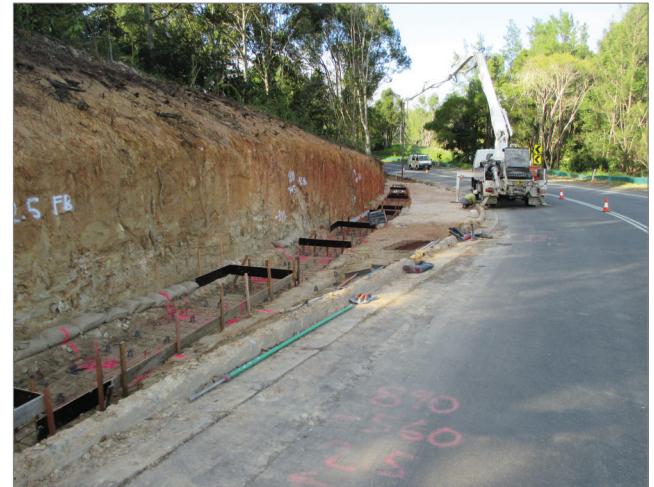
The curve of Kyogle Road was realigned at a dangerous spot at Terragon, thanks to funding through Black Program grants.

The upgrade of the road cost $1.05 million.