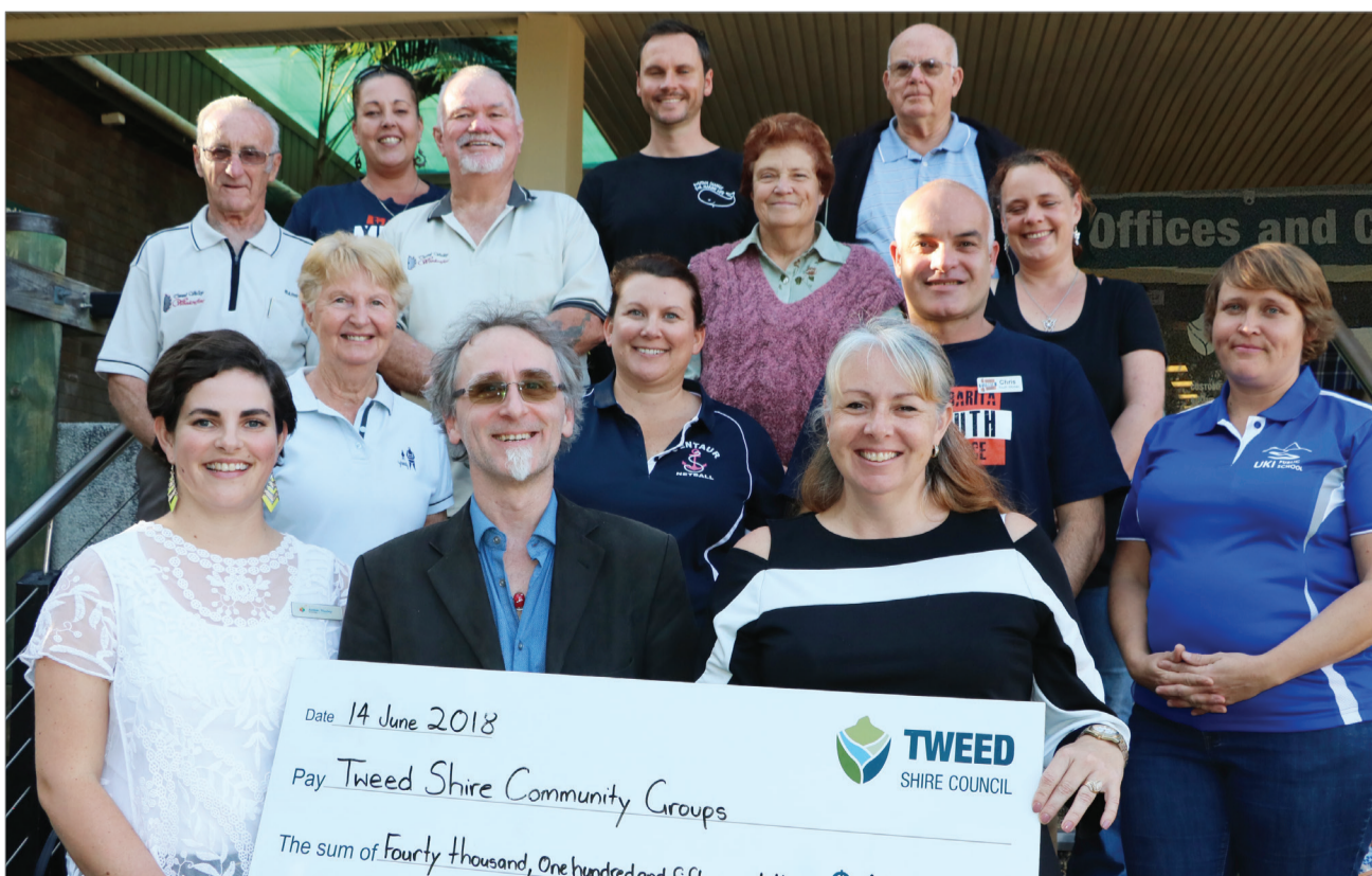
Congratulations to these representatives of community groups who were successful in securing funding through Council's Community Sponsorship Policy.