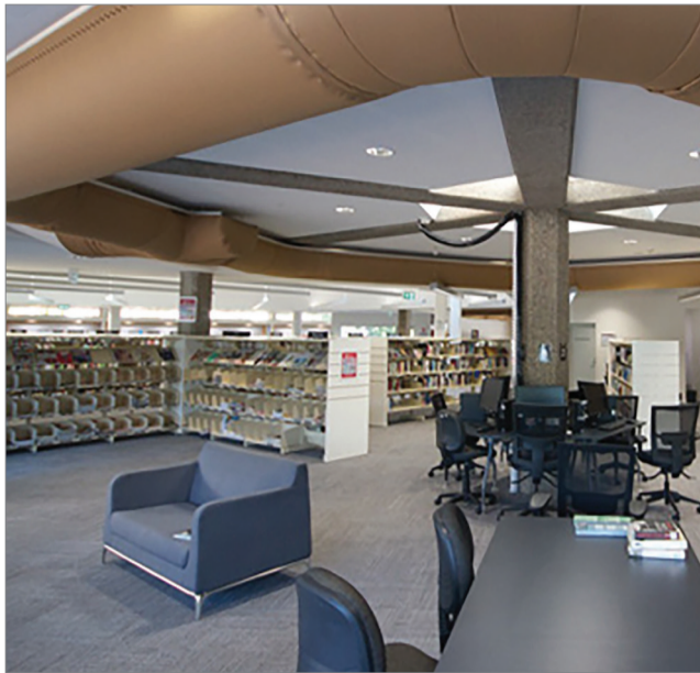
The interior of the refurbished Tweed Heads Library.

Storytime in the park – Murwillumbah Library and The Family Centre invite you to join us for a fun storytime and craft event in Knox Park on Wednesday 11 July at 10am. Bring your picnic