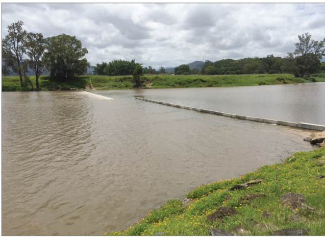
Bray Park weir is temporarily narrowed using concrete blocks ahead of threatening high-tide events.