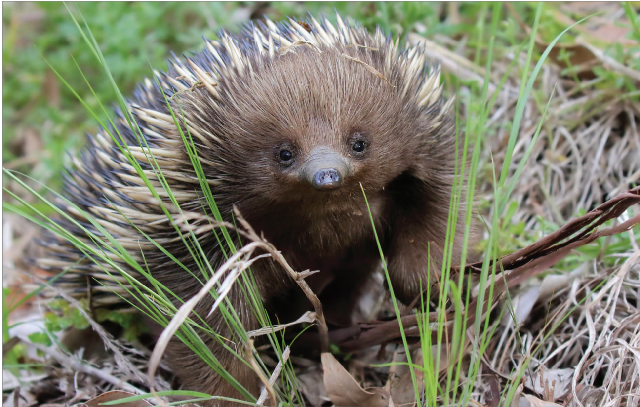
Short-beaked echidnas like the one pictured are on the move in and around the Tweed Valley.