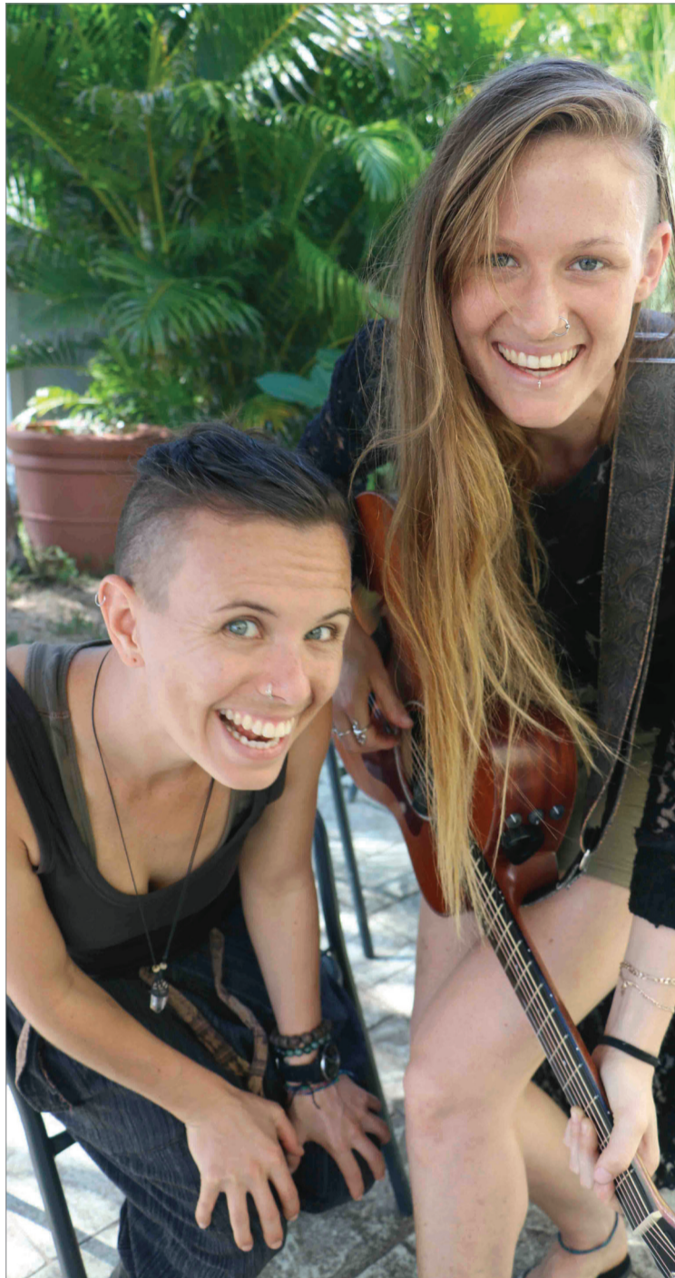
North Tumbulgum duo Salt & Steel will be playing at The Haven Bar as part of the MC 2 Festival on Saturday 19 May.

For more information about the Murwillumbah Art Trail visit www.themurwillumbaharttrail.com .