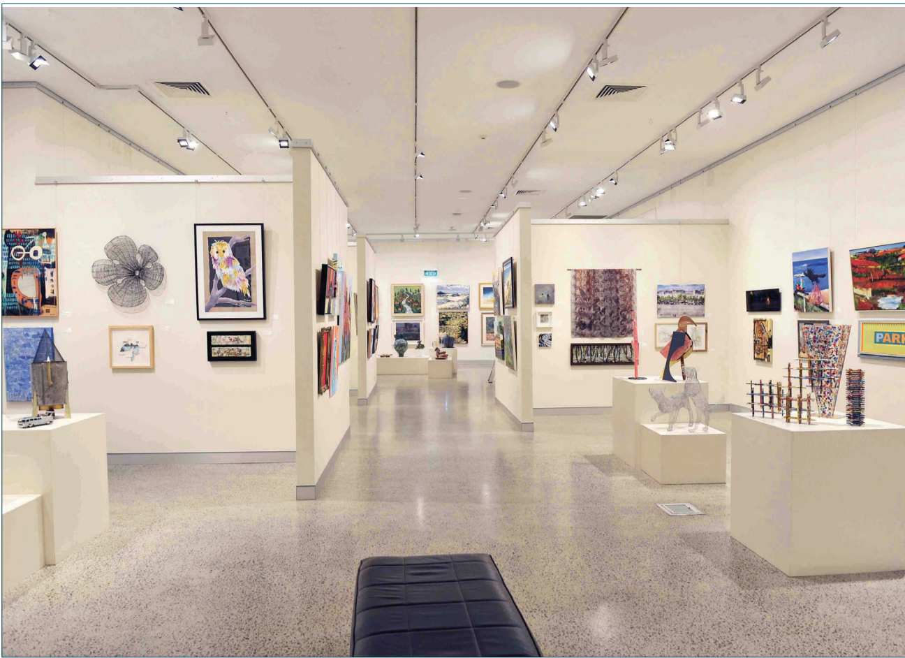
The 2016 Border Art Prize exhibition at the Tweed Regional Gallery.