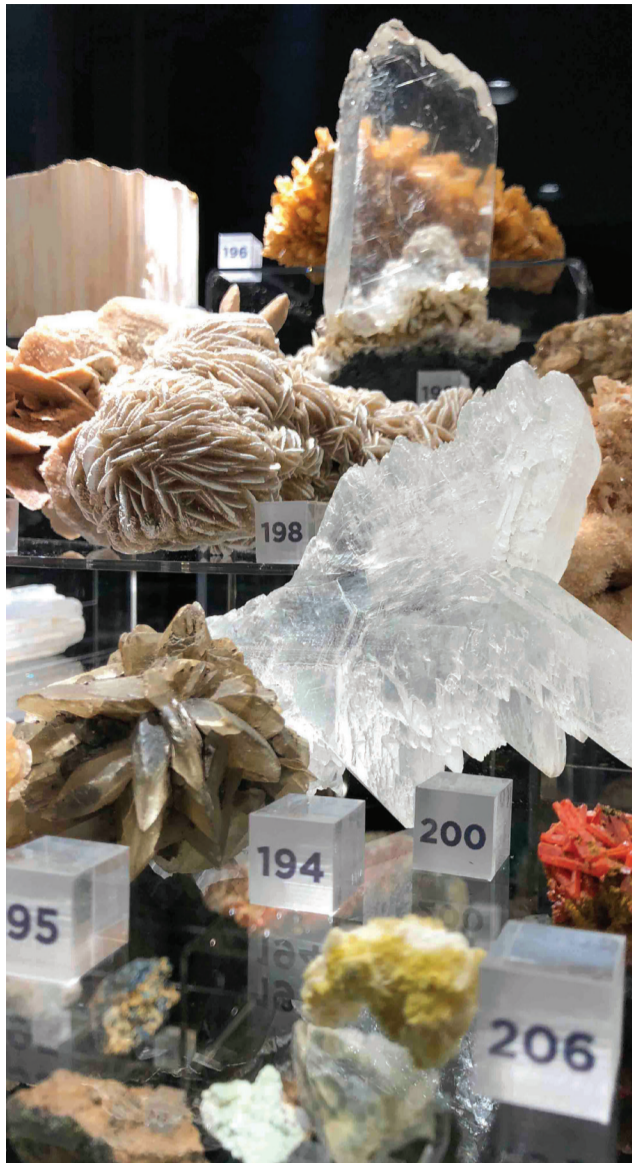
A small sample of Adrian Smith's collection.

For more information, visit the Museum website at museum.tweed.nsw.gov.au .