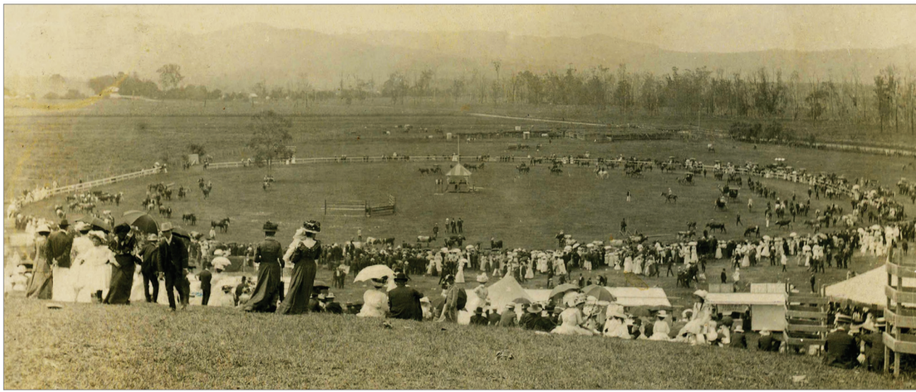
The Murwillumbah Show, circa 1900. The town's annual show is still held at these grounds.