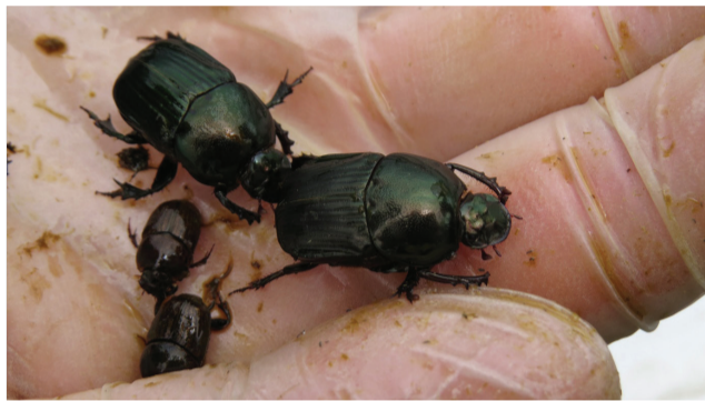
Dung beetles are beneficial to sustainable livestock production.

To learn more about Council's Sustainable Agriculture Program or participate in future workshops, field days and on-ground projects, contact Mr Szandala on (02) 6670 2400.