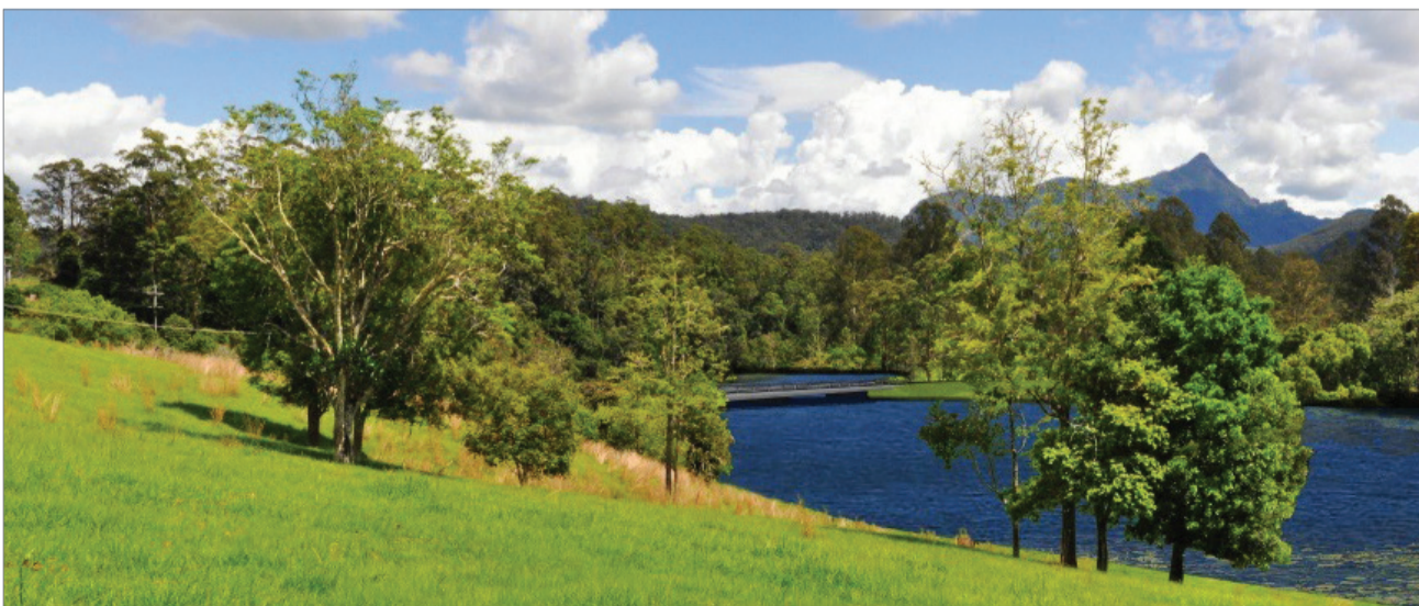
An artist's impression of what the new bridge might look like.

By early 2021, the project will be set to face its final hurdle before construction begins after a second independent consultant assesses all documentation and public submissions and makes a recommendation to the Minister to proceed or terminate the project.