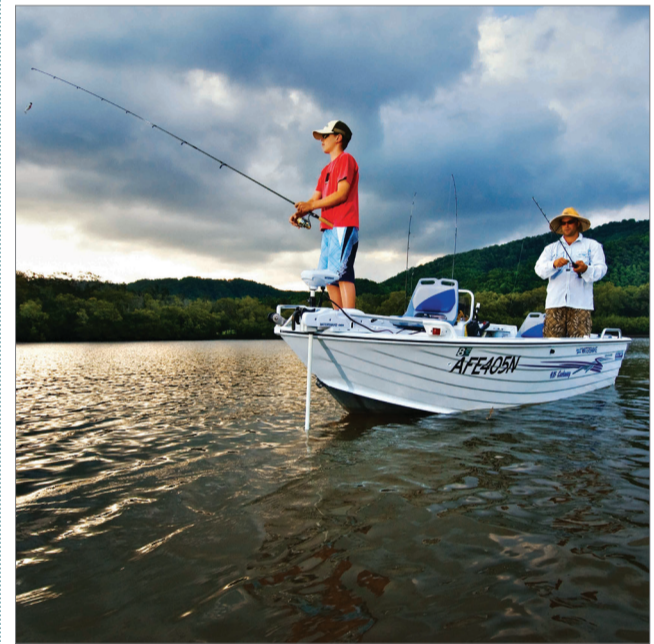
Fishers of all ages are invited to help in the eradication of tilapia – the 'cane toad' of Australian waterways.