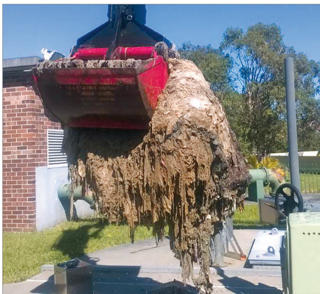
A wet wipe blockage is removed from a pump station.

Wipes in pipes is costing water authorities an estimated $15 million a year to clear blockages in household and municipal sewerage systems around Australia.