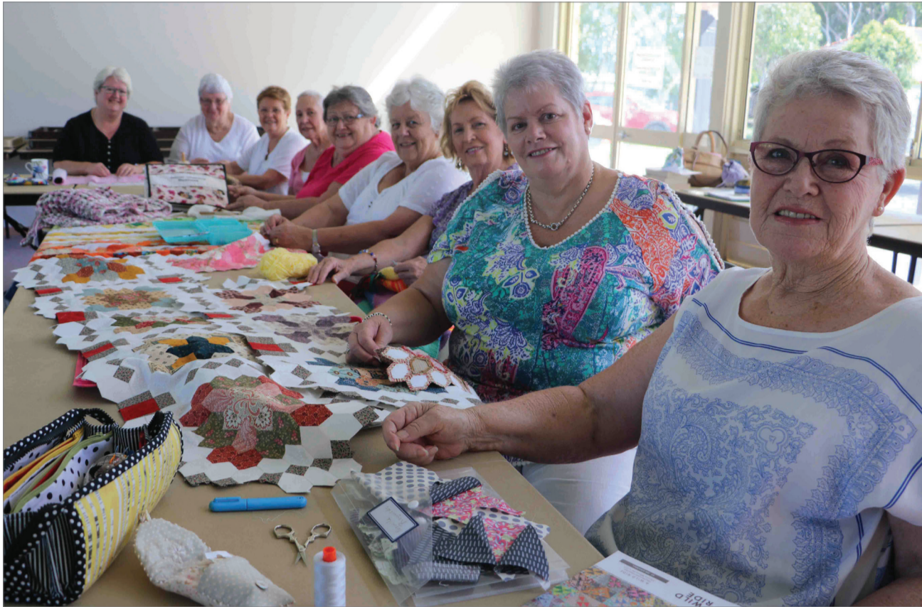
The Banora Point Stitches and Craft group at home at the South Tweed Community Hall.