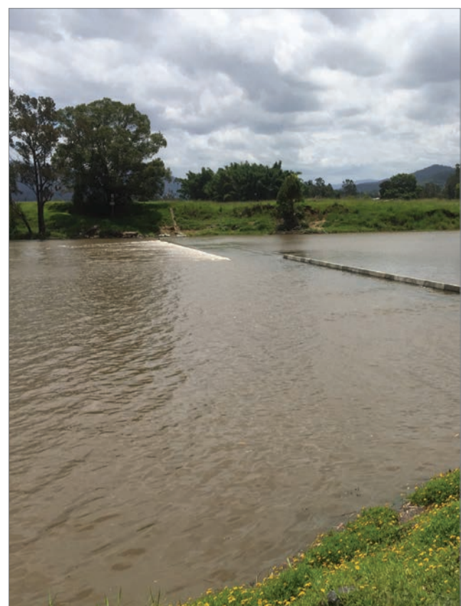
The Bray Park Weir Project Reference Group will aim to help identify and assess solutions to protect the weir from future tidal inundation.