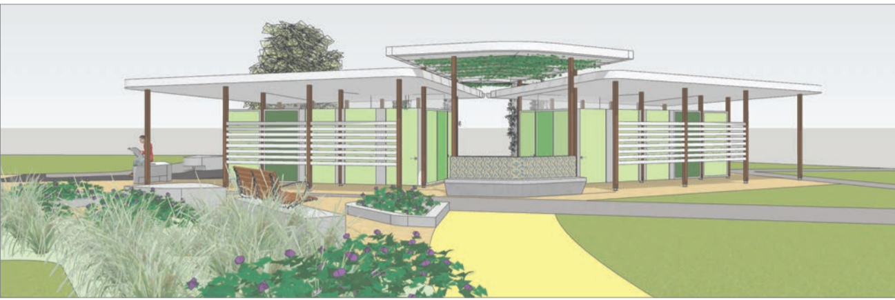
An artist's impression of the proposed Knox Park toilet block which will be located in a central position.