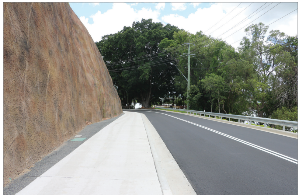
After nearly a full year closure, Tumbulgum Road, between Sunnyside Lane and Old Ferry Road, Murwillumbah, is again open to traffic and pedestrians. The above ‘before’ and ‘after’ photographs highlight just how big an improvement the stabilisation and roadworks project has made to this section of road for both motorists and pedestrians.