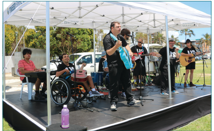
The US Band from Lifebridge got the crowd dancing at the first Festival of Belonging in the Tweed last Thursday.

See next week's Tweed Link for the 2017 Access Awards winners.