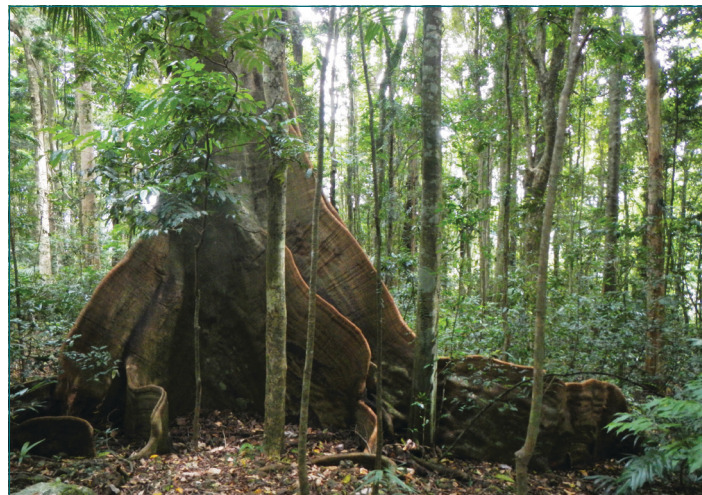
Local bushland has seen a prolific regeneration of native species through the Numinbah Nature Links program.