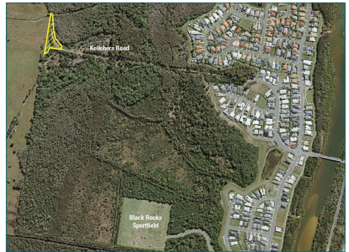
The proposed fox trapping areas shown at the Fingal Peninsula (left), Bogangar (centre) and Pottsville (right).