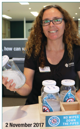
2 November 2017