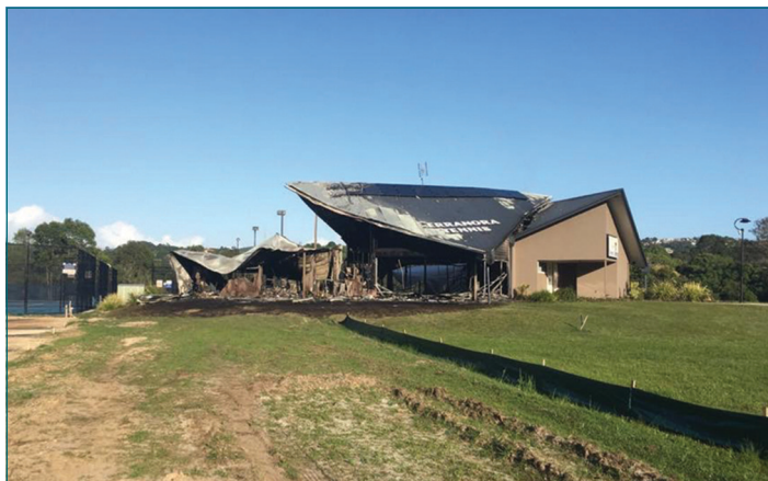
The clubhouse at Joan Nicholl Tennis Centre after the fire.