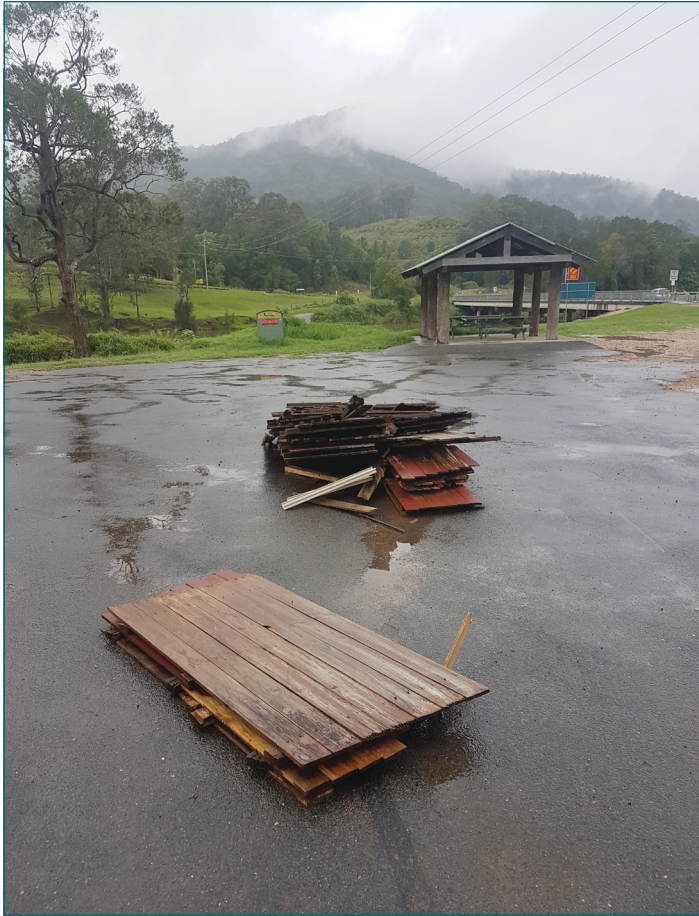
The dumped fence panels at Col Wiley Park.

If you recognise this fence as once being yours, please contact Council on (02) 6670 2400 and let us know the name of the contractor employed – and no doubt paid – to remove and dump it.