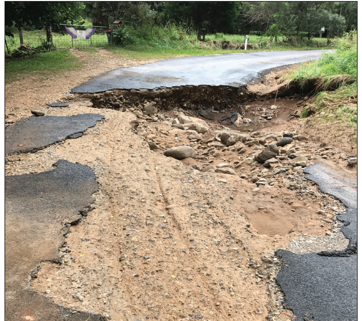
Flood damage to Booka Road, Upper Crystal Creek.

Under current estimates, Council expects to recover $18.3 million of its roads bill through Natural Disaster Relief and Recovery Assistance (NDRRA) and grant funding, leaving a possible shortfall of $8.7 million to be funded from Council’s future operating and capital budgets. These figures may change as we firm up damage estimates, work to maximise funding opportunities and when NDRRA