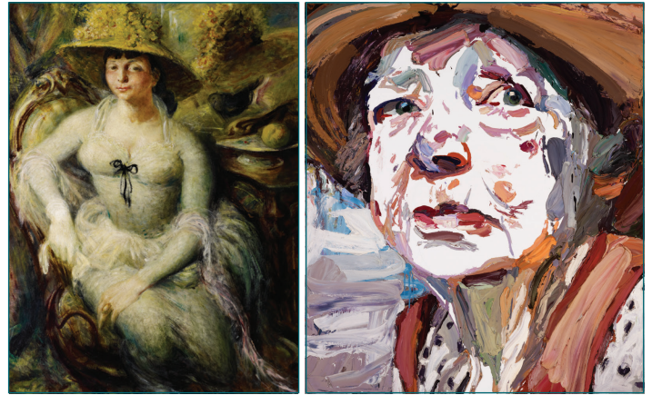
Archibald Prize winning portraits: Margaret Olley, 1948 by William Dobell (left) and Margaret Olley, 2011 by Ben Quilty (right)

Further details about the FESL are available at fesl.nsw.gov.au or by phoning the FESL information line on 1300 787 872.