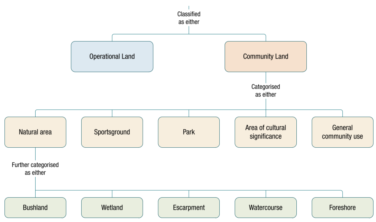
Figure 1: Classification and Categorisation as per Chapter 6 Part 2 of LG Act

To ensure that Council complies with section 3.23 of the CLM Act, Council must assign one or more categories of community land referred to in section 36 of the LG Act, to each crown reserve for which it is manager. The classification and categorisation is summarised in Figure 1 below: