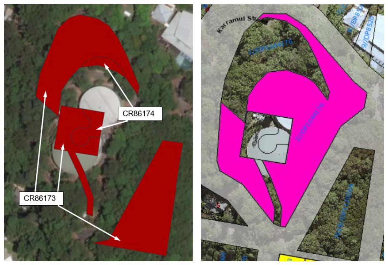
Figures 2 and 3: Lions Lookout Murwillumbah Land Tenure Left: Council Managed Crown Land Crown Reserves 86173 and 86174 mapped red Right: Council owned Operational land mapped pink

Council's Water and Wastewater Unit supports the classification of the abovementioned Crown Reserves where the reservoirs are located as operational. This will be consistent with the classification of the land where all other reservoirs across the shire are situated.