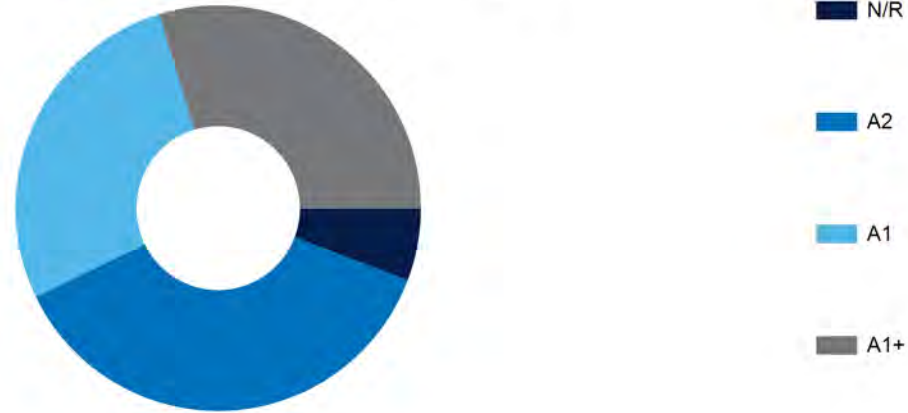
Market Value by Security Rating Group (Short Term)