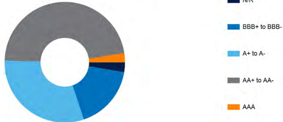
Market Value by Security Rating Group (Long Term)