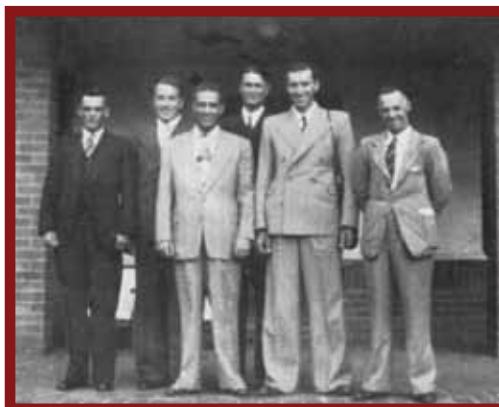
First new Australian citizens following the inaugural naturalisation ceremony held at Albert Hall in Canberra on 3 February 1949.

These requirements are described in more detail in Chapter 9.