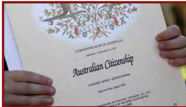
An Australian citizenship certificate

Children in this situation do not acquire Australian citizenship (even if they make the pledge or their other parent is present) and should not be provided with Australian citizenship certificates. They should be advised to take the matter up with an office of the department as soon as possible.