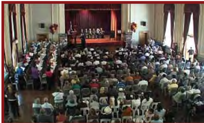
Citizenship ceremony at Albert Hall Canberra 2008

It is not appropriate for a citizenship ceremony to be held at a venue for the purpose of promoting a commercial enterprise.