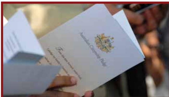
The Pledge of Commitment must be made by candidates at their citizenship ceremony.

local government councils by the department. Pledge cards may be placed on the candidates' seats or handed to candidates on arrival. Children under 16 years of age are not required to make the pledge but may do so.