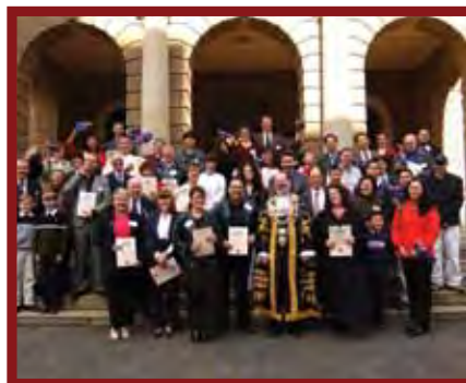
Australian Citizenship Day 2001 ceremony, Hobart Town Hall

Invitations to the minister's representative, members of parliament or community groups are not necessary for special purpose ceremonies. However if a member of parliament is invited invitations must be extended to all those required to be invited to public ceremonies. The attendance of family and friends is normally kept to a minimum. The Code applies to special purpose ceremonies in all other respects.