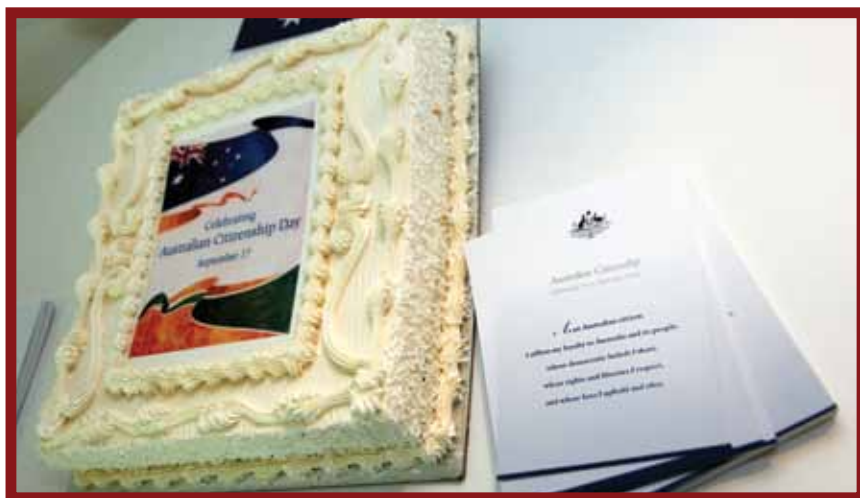
Cake to celebrate Australian Citizenship Day

The person leading the Australian citizenship affirmation ceremony should invite all who wish to publicly affirm their commitment to Australia and its people, to stand and join in repeating the affirmation.