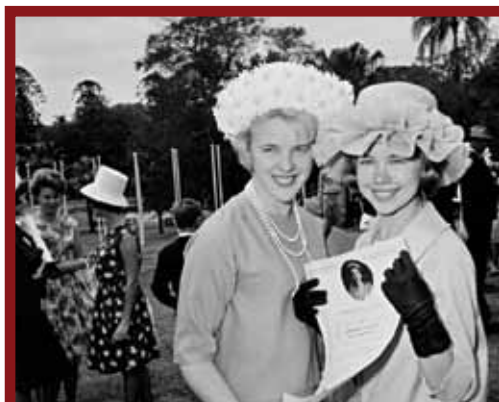
Ceremony at the Brisbane Botanical Gardens 1964

To maintain the dignity and propriety of the occasion, private commercial activities (for example sale of souvenirs) should not be associated with citizenship ceremonies.