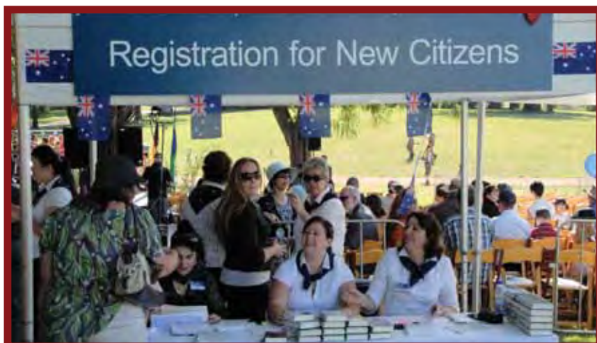
Registration desk for new citizens at the Australia Day 2008 citizenship ceremony, Commonwealth Park, Canberra