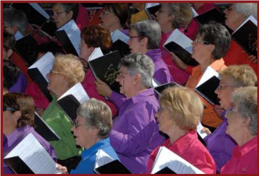
Sing Australia Choir, Australia Day 2008

Citizenship ceremonies are generally followed by a social gathering which includes refreshments. In making these arrangements, organisers should take into account any special dietary or religious requirements of candidates.