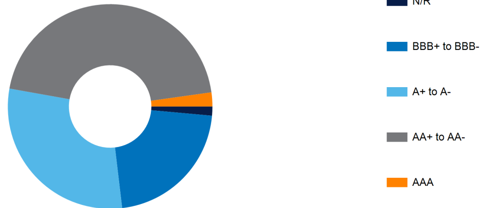
Market Value by Security Rating Group (Long Term)