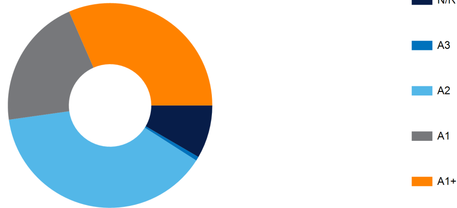
Market Value by Security Rating Group (Short Term)