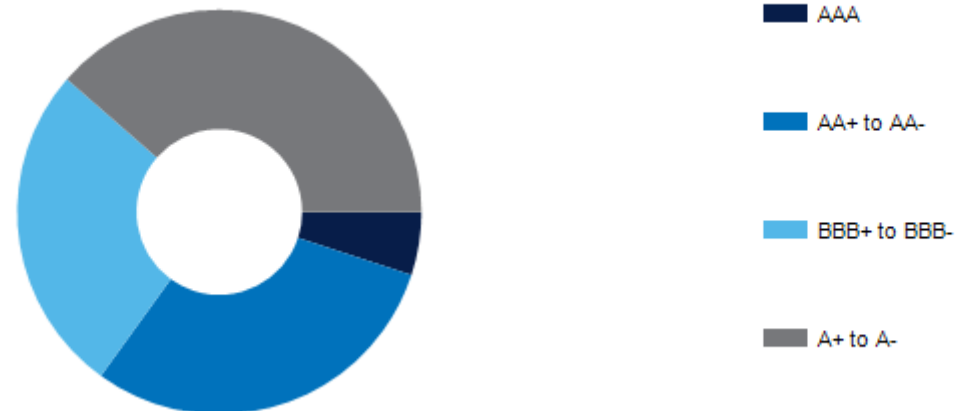
Market Value by Security Rating Group (Long Term)