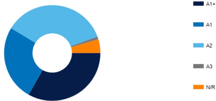
Market Value by Security Rating Group (Short Term)