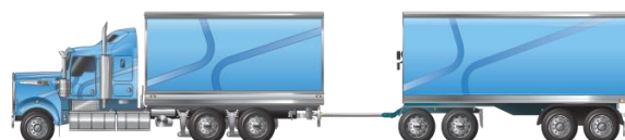
19-metre truck and dog